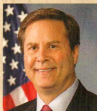
Donald Norcross United States Congressman